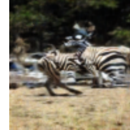
Q_{12}(w, f) \rightarrow P_{0.5}(w, f)