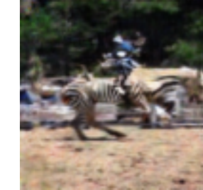
P_{0.5}(w, f) \rightarrow Q_{12}(w, f)